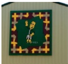
Willy Wirehand Barn Quilt