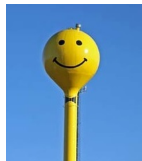
Smiley Water Tower Makanda IL